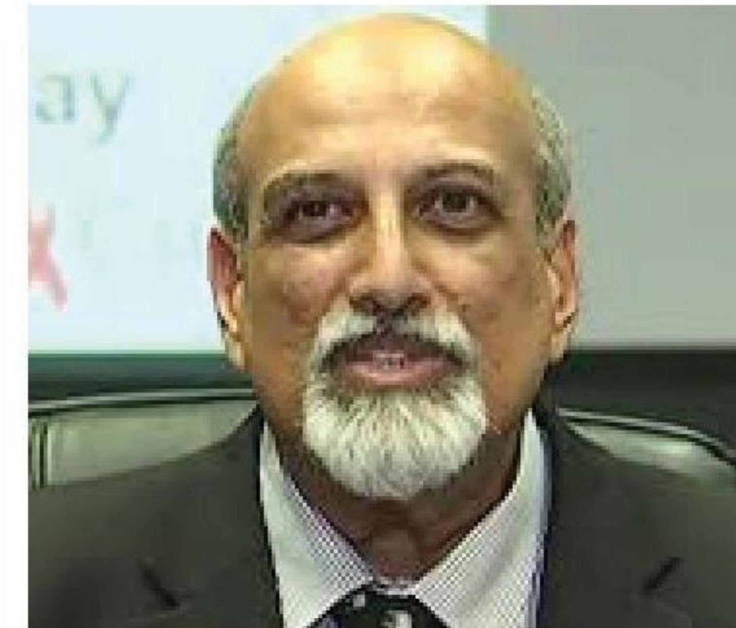
Prof Salim Abdool Karim chairs the ministerial advisory committee on Covid-19.

"Every country, once they reached 100 infections, have a